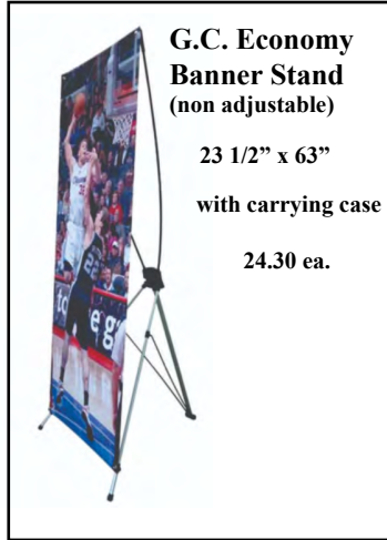
G.C. Economy Banner Stand (non adjustable)