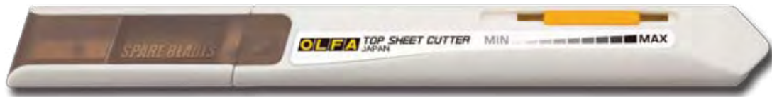
Actual size shown.