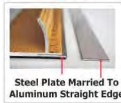
Steel Plate Married To Aluminum Straight Edge