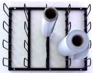
Chrome plated wall mount 164.00

Heavy Duty - Holds 16 rolls of up to 30" width material. Saves floor space and allows proper storage for vinyl adhesion life. Supplied with adjustable screw mounting clips allowing for stud alignment in most walls.