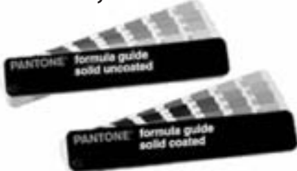
2 Guide Set - No. GP1301 122.00

Announcing the new PANTONE PLUS Series Formula Guides: These new Guides are the updated versions of the indispensable Pantone Matching System tools for selecting, specifying, and matching solid Pantone Colors. Users now have 1341 color choices - all of the current Pantone Colors plus 224 new, market-proven hues in a new chromatic arrangement. Ink formulations are provided to aid printer's mixing colors. Includes color index, and lighting evaluation tool. Set of two guides, coated and uncoated.