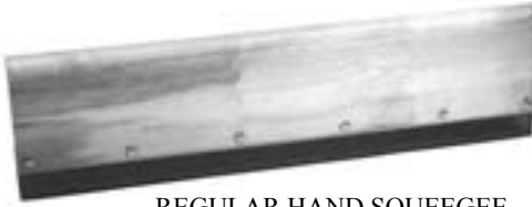
REGULAR HAND SQUEEGEE

Complete Squeegees are made to YOUR Specifications.