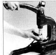
Pierce & Set - Each Grommet cuts its own hole and washer controls roll over for smooth secure fit