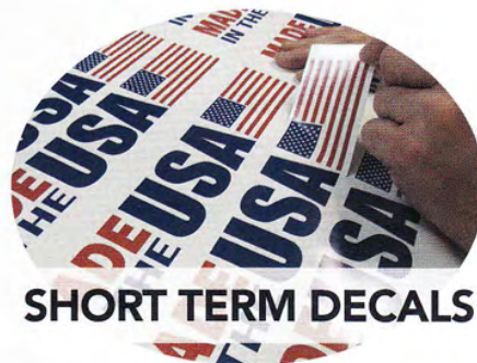
SHORT TERM DECALS