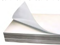
90lb. layflat liner

Printability: Note- These vinyl sheets and rolls are printable with screen printing vinyl inks or UV cured screen printing inks.